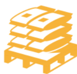
Bagging Pellet / Chemical / soil