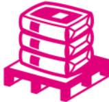
Cement / mortar