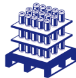
pack cans / metal boxes