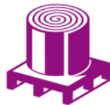
Paper / board