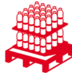
pack plastic bottle