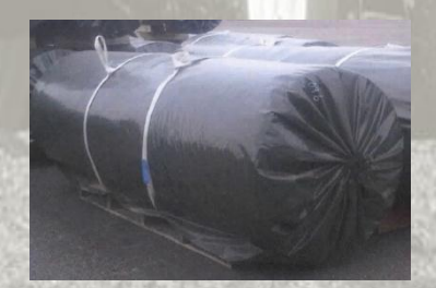
1 roll has 300m / pallet